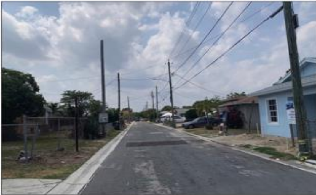
Lincoln Road: Before and After Improvements to the Streetscape