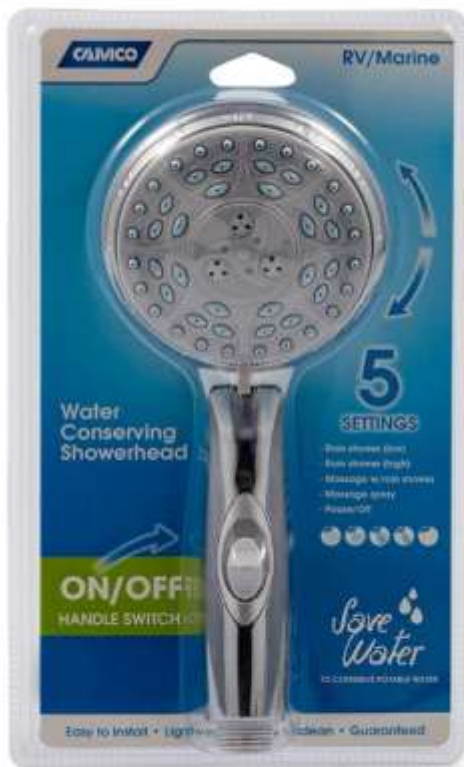
On Off Control at the handle